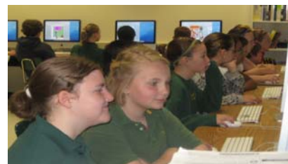
6th grade students hard at work on their book project in the McDaid Elementary computer lab.