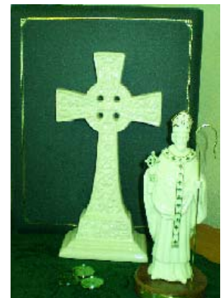
Are you a member of the "Legacy Society?" Please let us know, so we can honor you with a special statue of St. Patrick.

Please notify us if you have chosen to include the Endowment in your will or estate plan so that we can honor you for your generosity.